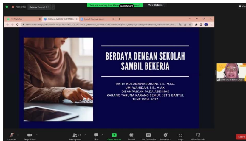
Figure 2. Implementation of activities

The implementation of community service is carried out through a zoom meeting, considering that the participants are Karang Taruna Desa Karangsemut, which both study and work. It took place on Thursday, June 16, 2022, at 19.00 WIB and was attended by 74 participants, who were divided into two material sessions. In this day and age, it is much simpler for people to obtain information via zoom or webinars, because direct communication can be conducted even if it is only virtual are presented in Table 2.