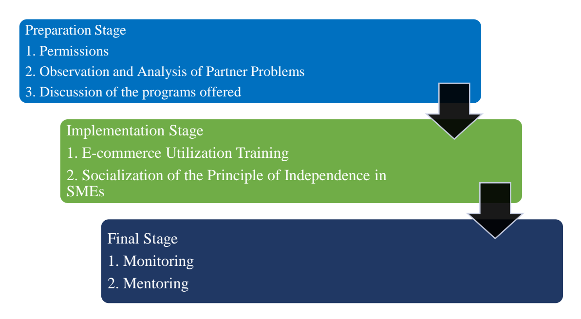
Figure 1. Stages of Community Service Implementation

The method of implementing community service activities uses the method of observation, training, and socialization. Observation is used to find information about the condition of partners and the problems they face. The training method is used to provide education and understanding to Fajar Bakery employees about the use of e-commerce. Meanwhile, the socialization method was used to provide participants with an understanding of the principle of independence. Broadly speaking, the stages of implementing community service activities are presented in Figure 1.