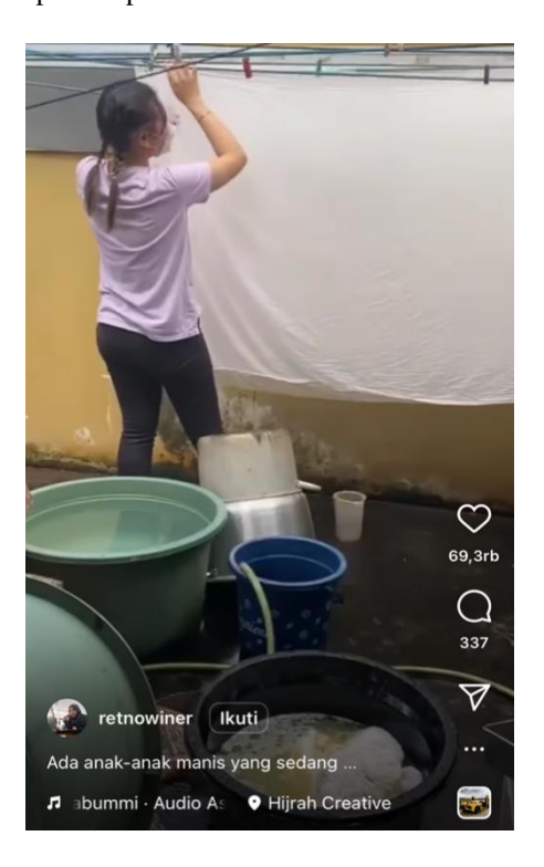
3.2.3. Screenshots of content that has won a lot of viewers