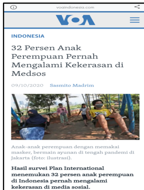
Figure 2. Violence against girls on social media

There are many examples of cases of sexual harassment against women. And most of these women are school dropouts. Lack of knowledge about this is very dangerous because it can affect survival. From Voaindonesia, there is 32 percent of girls who have experienced violence on social media, as in Figure 2 which explains that violence against women also occurs on social media.