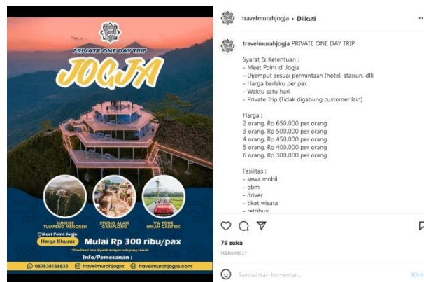
Fig. 1. Information content uploaded to the @travelmurahjogja account on Instagram