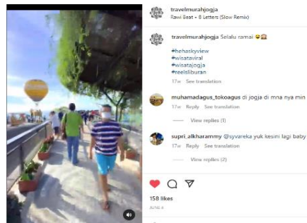
Fig. 3. Instagram content @travelmurahjogja