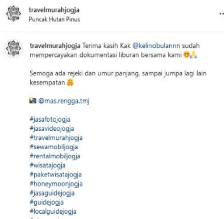
Fig. 6. Instagram content sharing @travelmurahjogja