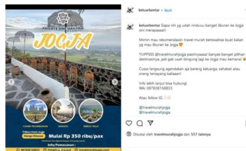
Fig. 5. Paid Media Content Distribution

In addition to using media owned by the researchers, they also found documentation that Travel Murah Jogja also uses paid media to distribute its content so that the content can reach and acquire new consumers.