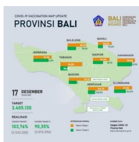
Fig. 2. Number of Participants for Dose 1&2 Vaccination of Bali Province in 2021

The green zone in the province of Bali, designated as a tourism recovery plan, is selected based on the potential demand and longing of domestic and foreign tourists to return to the natural attractions of Ubud, Sanur, and Nusa Dua 10 . Reviewing the potential for tourism recovery prepared by the central and local governments for the green zone, it is interesting to look at the marketing communication strategy. The implementation of the tourism recovery plan will undoubtedly significantly impact improving the economy of the Balinese people, who only rely on tourism as a livelihood. Referring to Figure 1.1, the data obtained until the end of 2021, tourism in Indonesia, especially the province of Bali, has not been able to increase significantly, especially in the three green areas echoed by the central government as priority areas for tourism recovery in early 2021.