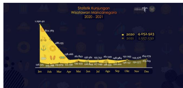
Fig. 1. Number of Foreign Tourist Visits to Indonesia 2020-2021

their jobs and even do not get a livelihood for their living needs. According to data on foreign tourist arrivals by the Ministry of Tourism and Creative Economy of the Republic of Indonesia, it was found that the intensity of the number of foreign tourists visiting from 2020 to 2021 can be seen in the following table: