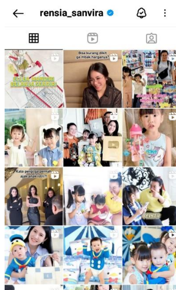
Fig 2. Photo content parenting rensia sanvira

The aim is to facilitate children being able to be responsible (independent) and contribute as part of society who will never let go of implementing their values as servants of God (according to the era in which they will live) by involving three keys to parenting, namely: Efforts to meet children's needs for physical, spiritual, social and emotional well-being to protect children by avoiding potential accidents and abuse of children. Provide rules and ensure that the rules are controlled and can be enforced; Supporting children in developing their potential, where if this is done correctly, the children in their care will be able to become a good generation and also be a comfort to the eyes and hearts of their parents.