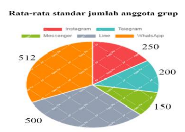
Fig. 1. Percentage of group members' adhesive power

Nowadays, society is inseparable from the technology that exists, including the development of social media. Developing technology has offered a lot of ways to access news or just exchange news with each other. Some of them are like an extensive range of instant messaging applications and other applications. This technology was later better known in society as "social media". With social media, it's easy for people to interact at unlimited distances and indefinite times. Not only that, with some social media apps, people can simultaneously hang out or even meet a group of people in a chat room, called a group chat. Here's a percentage of the standard appearance of chat group members from some popular social media sites in Indonesia.