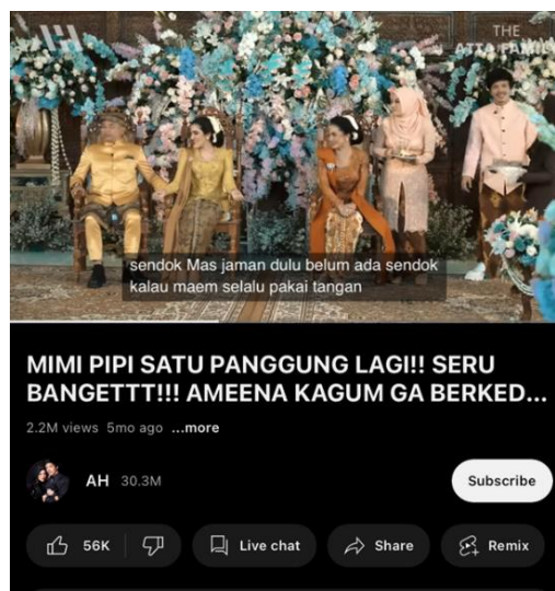
Fig. 2. Video of "MIMI PIPI ONE STAGE AGAIN!!! EXCITING!!! AMEENA AMAZED NOT BLINKING!!!!"

The second element at the semantic level is the detailed microstructure. In this detail element, the creator presents the text in a video that benefits Atta Halilintar in his YouTube channel, raising two objects that have been described, namely parenting, and daily family activities, for example in the uploaded video entitled "MIMI PIPI ONE STAGE AGAIN!!!! EXCITING!!! AMEENA KAGUM GA BERKEDIP!!!!" in this video upload, it can be seen that the youtube channel creator Atta Halilintar presents a caption text that makes it easy for viewers who are not very clear in capturing the conversation being discussed in the video, besides that the video is proof that Atta Halilintar's youtube channel also uploads daily family activities, not just parenting. So, it can be concluded that the Atta Halilintar YouTube channel as a whole has a family theme. Both nuclear family and extended family.