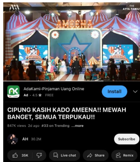
Fig. 1. Video "CIPUNG KASIH KADO AMEENA!!! VERY LUXURIOUS, ALL AMAZED!!!!"