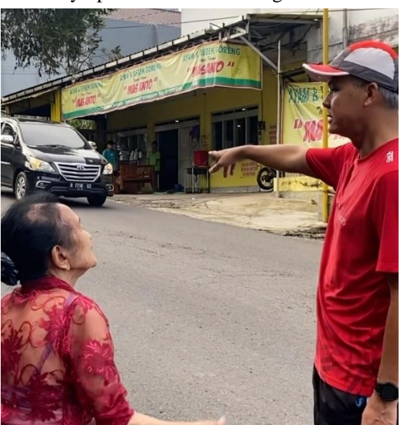
Fig 7. One of @ganjar_pranowo's instagram posts four days after the declaration of presidential candidacy - April 25, 2023.

A post that also received a lot of public reaction was uploaded on the fourth day. The post used a video format containing Ganjar's activities while running but was interrupted by a grandmother who invited him to talk for a moment. The post managed to get the most comments totaling 4,255. In the video, the grandmother praises Ganjar several times and hopes he becomes the next President of Indonesia. Many agreed with the grandmother's words in the comment section, but not a few disagreed with them. Those who disagree consider the post a set-up to make Ganjar's image as a leader more visible. The visual of the fourth day's post can be seen in Figure 7.