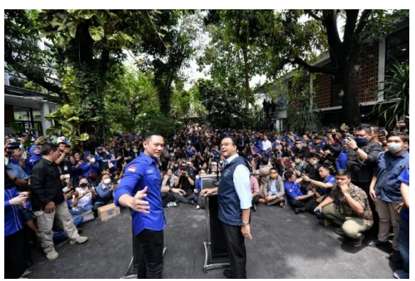
Fig 5. One of @aniesbaswedan's Instagram posts four days after the declaration of his presidential candidacy - October 7, 2022.

The post that also received many likes and comments was the fourth day's post with a difference of 147 comments from the fifth day's post. The fourth day's post featured 10 photos containing a meeting between Anies Baswedan and Agus Harimurti Yudhoyono along with the DPP of the Democratic Party. One of the visuals of the fourth day's post can be seen in Figure 5, complete with a long text explaining the photo in question.