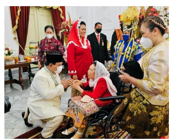
Fig 2. One of @prabowo's instagram posts five days after the declaration of presidential candidacy - August 17, 2022 (source: instagram.com/prabowo).

On the fifth day of posting, Prabowo uploaded photos of himself with several popular political figures, namely with President Jokowi, Golkar Party Chairman Airlangga Hartarto, Coordinating Minister for Maritime Affairs and Investment Luhut Binsar Pandjaitan, and with Sinta Nuriah Wahid and Gus Dur's daughter (figure 2).