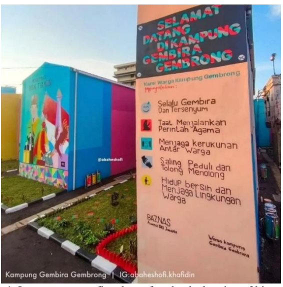
Fig 4. One of @aniesbaswedan's Instagram posts five days after the declaration of his presidential candidacy - October 8, 2022.