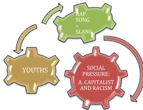
Figure.1. The Smart Graphic of Rap Song Relation to Youths' Social Background

Rap Song is a fantasy of all sweet escaped for youths and the platform for them to voice out their current psychology resulted from inner or social pressure. Rap language helps them to opt out. The moment the speakers practice the slang it is relatable to youth also reinforce their identity as a fresh and free spirit human being. More than that historical background that slang existences is to break language hierarchy was also be the basic reason why slang is always progressive