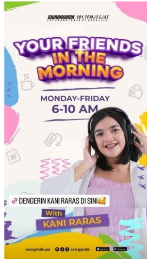
Fig. 1. Swaragama FM Instagram Story

media Instagram, Tiktok, Twitter and Facebook as an effort to connect with listeners through the programs it creates. The efforts made are by continuing to make interesting broadcast programs, updating news every day according to what is viral. Through the broadcast programs provided, Swaragama FM creates content with market segmentation from teenagers to adults from the age of 18-35 years, the majority of which are students in Yogyakarta. For example, what is trending and liked is K-pop, then Swaragama FM programs and content follow how listener interests ranging from songs, broadcast themes, k-pop content on social media and so on.