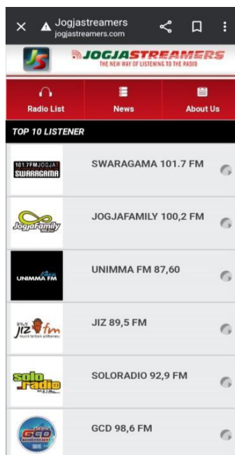
Fig. 3. Top Listeners streaming Jogja