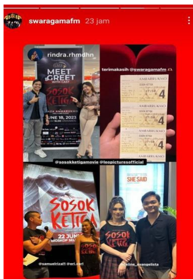
Fig. 7. Instagram Swaragama FM