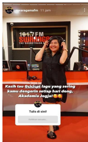
Fig. 5. Instagram Swaragama FM

maintaining their loyalty to this radio brand. (5) Promotion and Interaction with listeners: Swaragama FM programs that involve listeners, such as games, quizzes, or telephone connections with listeners such as those done through whatsapp, live Instagram or tiktok Swaragama FM can increase emotional bonds and invite audiences to continue listening. (6) Broadcast Quality: The technical qualities of the broadcast, such as the clarity of the sound and the lack of interference from Swaragama FM radio, also play a role in influencing retention. Poor broadcast quality can make listeners switch to other sources of entertainment. (7) Marketing and Branding: The strong marketing and branding efforts and activities of Swaragama FM have so far helped to attract the attention of potential listeners and form a positive image about the radio station. (8) Technological developments: As technology progresses, Swaragama FM continues to improve its radio services and quality such as being reachable to listeners through online streaming or mobile applications can affect the way listeners access radio broadcasts. The availability of these platforms can also affect customer resilience. (9) Social and Cultural Trends: changes in social and cultural trends can also affect customer resilience. Swaragama FM is able to adapt its content and programs to current trends and issues tends to retain listeners.