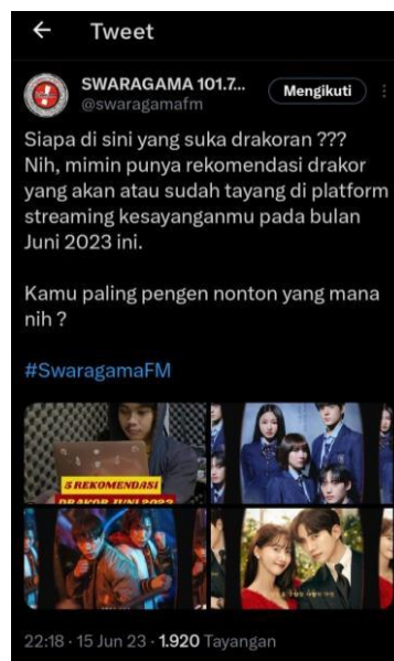
Fig. 2. Twitter Swaragama FM