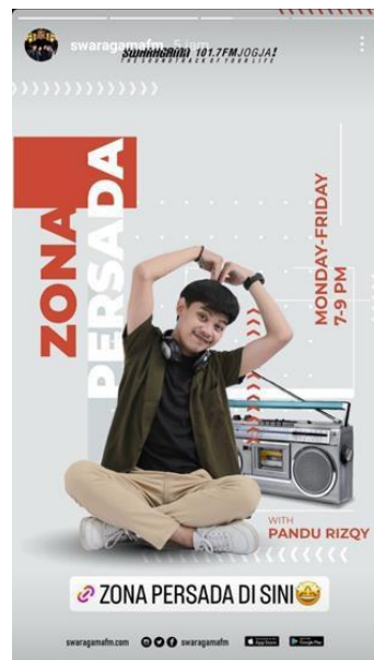
Fig. 4. Swaragama FM Instagram Story