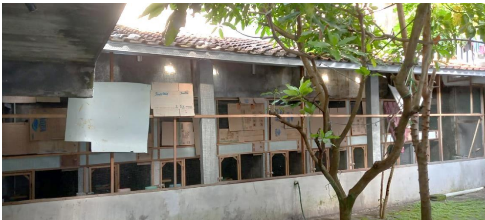
Figure 1. Condition of Livestock Birds 1

In this community service activity, we will partner with hamlets in Klaten Regency. Banjarjo is one of the hamlets located in Kragilan Village, Gantiwarno District, Klaten Regency. Profile of the Banjarjo hamlet, its residents have a business for the Murai Batu bird, which is quite popular among bird lovers. The focus of the business is the Medan Batu Murai bird, which has a short tail with good sound quality when used for bird chirping competitions. The advantages of short-tailed Murai Batu birds include the bird's stamina is stronger because it has a short tail, its movement is more agile, it can print its tail, large body, its tail is rarely faked because the interest is not among collectors but indeed for competitions, and the price is more affordable than long tails. Based on these advantages,