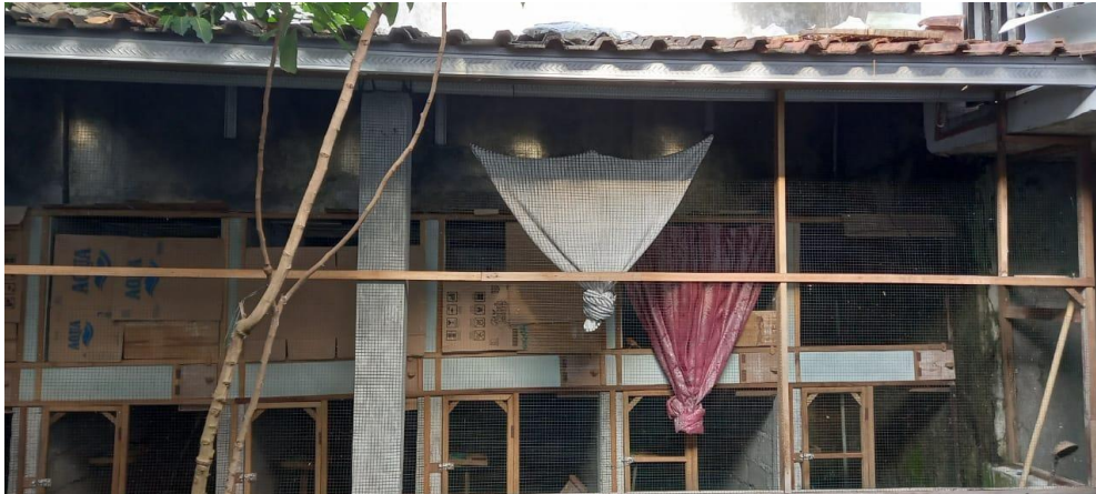
Figure 3. Condition of Bird Livestock 3