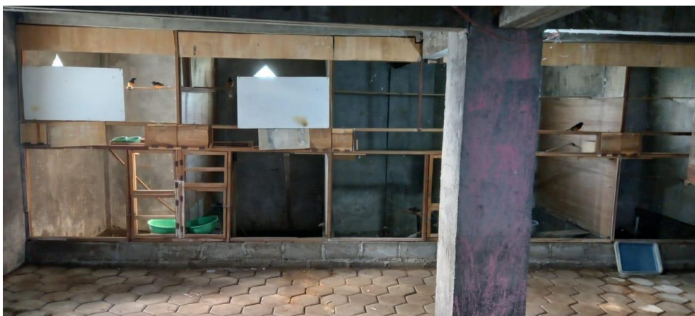
Figure 2. Condition of Livestock Birds 2