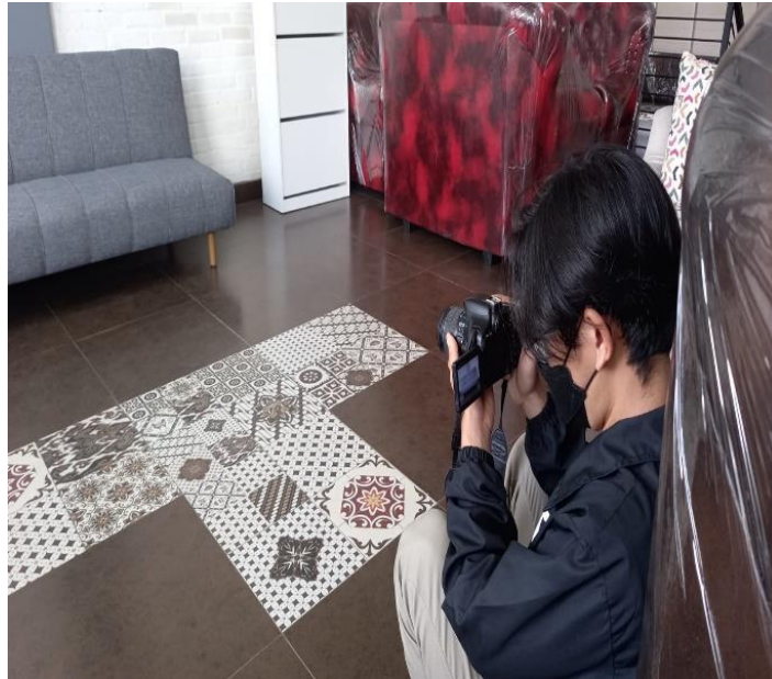
Figure 2. The example of product catalog

After completing the programs, there are several evaluation and lesson learned. There are various necessary activities related to business operations conducted during the one month community services. All the activities that is conducted bring significant changes to the problems faced by the company. These problems are then searched for solutions by the implementer to produce changes that are expected to be continued in a further projects. Some of these changes are then evaluated to ensure the changes that the author makes can be carried out properly and successfully. The evaluations that the author did include: