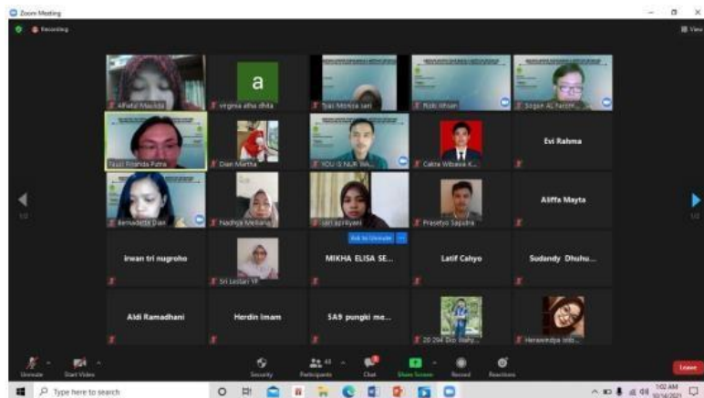
Picture 1. The attendant of participant.