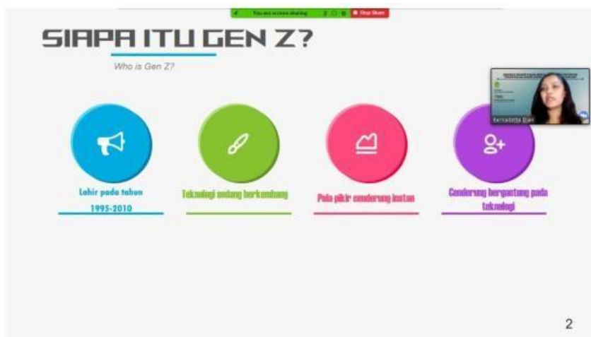
Picture 3. Delivery material speech by second speaker.

By investing, we will be Creating new sources of income, Securing money, Reducing forested habits, and Preparing a pension fund. So, benefits of investing tha Have passive income, As a savings of the future and Harnessing money for more useful things. There are type of investment: