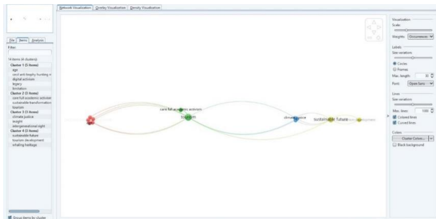
Fig. 1. The search for recent articles on sustainable tourism in the last ten years, from 2013 to 2023, was conducted.

One of the social media platforms increasingly used to promote travel destinations and campaign for sustainable tourism principles is Instagram. In 2021, there were 1.21 billion monthly active users on Instagram, accounting for more than 28 percent of global internet users, and there will be 1.44 billion monthly active users, comprising 31.2 percent of global internet users by 2025 (Statista, 2023). With its primary focus on visual content, Instagram allows users to share photos and videos of their travels while conveying the importance of preserving the environment, culture, and local communities.