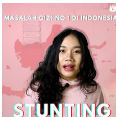
Fig 11 Content on the Instagram account @cegahstunting with the most responses

Audience response is the feedback or reactions given by the audience to a campaign message or communication directed at them. To achieve a positive audience response, the message must possess skills that engage the public. Many aspects need to be considered, such as emphasizing what people will understand, how the message can capture the audience's attention, and how information receivers can retain and remember the information they receive. Here are some examples of content with a positive audience response on the Instagram account @cegahstunting: