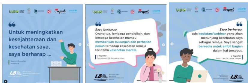
Fig 4. Content on the Instagram account @cegahstunting based on the Evoking indicator

The message within the content above has incorporated several essential aspects in crafting a campaign message. One of them is illustration, which provides a depiction of how teenage marriage practices with an illustration of students getting married to capture the audience's attention, and using illustration images to explain the various factors that underlie teenage marriages.