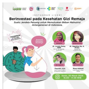
Fig 6. The content on the Instagram account @cegahstunting indicates the usage of models or reference groups Caption: “[Pekan Kesehatan Remaja Internasional 2023 semakin dekat!] Tahukah kamu, pada bulan Maret setiap tahunnya, dunia selalu memperingati pentingnya kesehatan remaja, loh! Tidak hanya mengulik tentang area kesehatan, kita juga perlu membahas tentang dampaknya pada multisektorial! Bekerjasama dengan banyak pihak besar, ikuti terus bahasan seru dan perbincangan interaktif kita pada seri ig live: 📺 : Senin, 20 Maret - 24 Maret 2023 🕒 : 16.00 - 17.30 WIB 📱 : @cegahstunting Jangan lupa ikuti kami terus ya!”

Out of the 71 analyzed contents, 64 of them featured a repetition, namely the use of the hashtag #cegahstunting. This hashtag is a distinctive feature and the primary goal of the campaign carried out by the Instagram account @cegahstunting, which aims to prevent stunting in children through preventive education. While some contents did not include #cegahstunting in their design, the hashtag was still included in the caption. However, there were 7 contents that did not use this hashtag, as they were excerpts from Instagram Live sessions of the Instagram account @cegahstunting and collaborative content with other accounts.