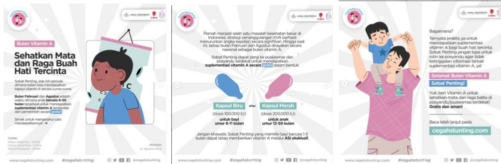
Fig 1. Content on the Instagram account @cegahstunting based on the Verbalization indicator

From the table above, it is known that out of 71 contents uploaded by the Instagram account @cegahstunting, almost all the message content indicators are present except for the humor indicator. Here are examples of content for each of the indicators: