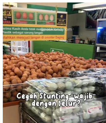
Fig 2. Content on the Instagram account @cegahstunting based on the Visualization indicator

The content in the above examples has utilized several important aspects in campaign message writing. One of them is verbalization, using a rhyming headline to make it more appealing, such as "Sehatkan mata dan raga buah hati tercinta" (Keep the eyes and bodies of your beloved children healthy). Additionally, the content provides detailed information about efforts to maintain children's eye health and concludes with a call to action to learn more on the website cegahstunting.com . This demonstrates effective campaign message writing by using catchy language, providing informative content, and directing the audience to additional resources for more information.