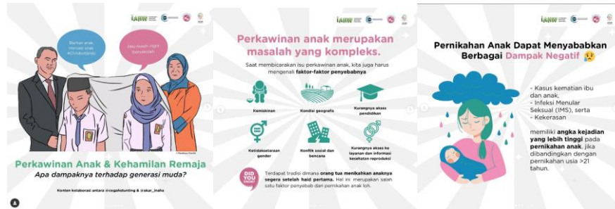
Fig 3. Content on the Instagram account @cegahstunting based on the Illustration indicator

The content in the examples you provided effectively utilizes several important aspects of campaign message writing, including visualization. By using video as the format for conveying the message, it engages the audience through visual content, making the campaign more dynamic and engaging.