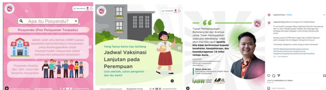
Fig 5. Content on the Instagram account @cegahstunting based on the Repite indicator

The message within the content above has incorporated several crucial aspects in crafting a campaign message. One of them is 'evoking,' which provides content to stimulate, arouse, and create specific reactions or emotions in the audience. The content above contains heartfelt expressions from @cegahstunting respondents who are attempting to convey their expectations for the health of Indonesia. Through this post, the audience may experience the same sentiments..