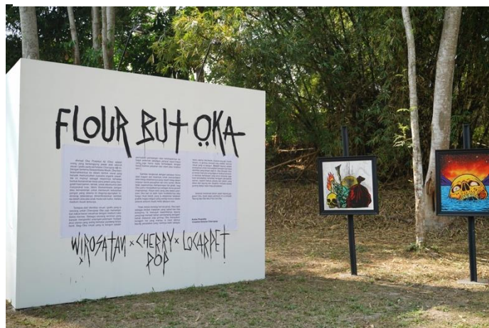
Figure 3. Cherrypop Festival 2023 Art Exhibition, by Ahmad Oka a.k.a Wirosatan

Finally, in its second year, the festival included Ahmad Oka, a.k.a Wirosatan, as the person in charge of all visuals at Cherrypop Festival 2023. Ahmad Oka specifically created an agrarian visual work with an approach to the theme of Cherrypop Festival 2023. Oka's visuals for the Cherrypop Festival 2023 artworks are everyday visuals that Oka sees around his home in the mountains of Sumowono, Semarang. Oka's solo exhibition at the front of the Cherrypop Festival 2023 area, Flour But Oka, became one of the most popular spots for visitors.