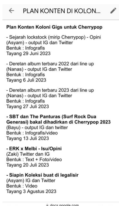
Figure 5. Content Plan for Cherrypop Festival 2023 by Koloni Gigs

According to Nisberg, publication is essential for marketing and disseminating information to show, introduce, and maintain the name and honor of a person/ group/ organization to the audience in a particular context through the media to create audience appeal (Liliweri, 2011). Publications disseminating information about Cherrypop Festival 2023 use social media, such as Instagram and Twitter, billboards, banners, and posters distributed at various strategic points. Cherrypop Festival 2023 also works with media partners such as online media, media buzzers, and radio that provide ad-libs. These media were chosen based on criteria by Cherrypop 2023, one of which is media that often discusses concerts, festivals, and music. Durianto explained that one of the considerations in using media is effectiveness, where each media has its characteristics tailored to the type of information you want to publish (Durianto, 2003).