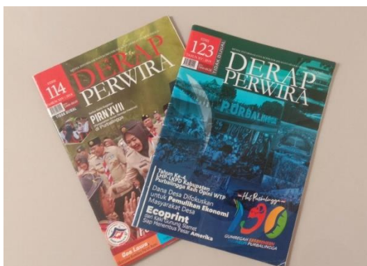
Fig. 1. Photo of the Derap Perwira printed magazine

Derap Perwira Magazine is a mass media product managed by an editorial team consisting of employees of the Purbalingga Regency Communication and Information Service (Dinkominfo). Dinkominfo Purbalingga is an agency responsible for processing information within the Purbalingga Regency Government. The Derap Perwira editorial team is part of the Public Information and Communication (IKP) sector. IKP itself is the sector that manages public disclosure at the Purbalingga Dinkominfo, including managing its social media. The Dinkominfo Purbalingga office is located on Letkol Isdiman street, 17A, Purbalingga. The following is part of the editorial team from Derap Perwira Magazine: