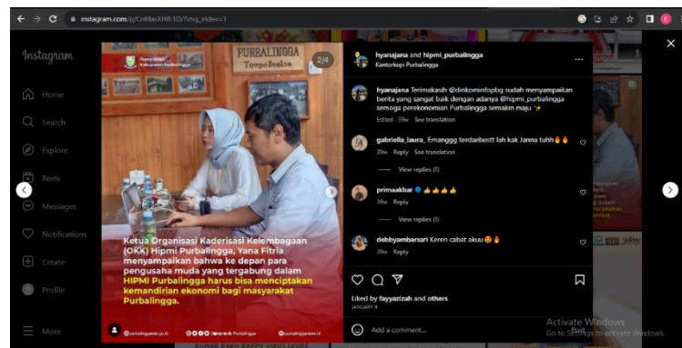
Fig. 4. Screenshot of re-uploading Instagram content @dinkominfo_pbg by @hipmi_purbalingga