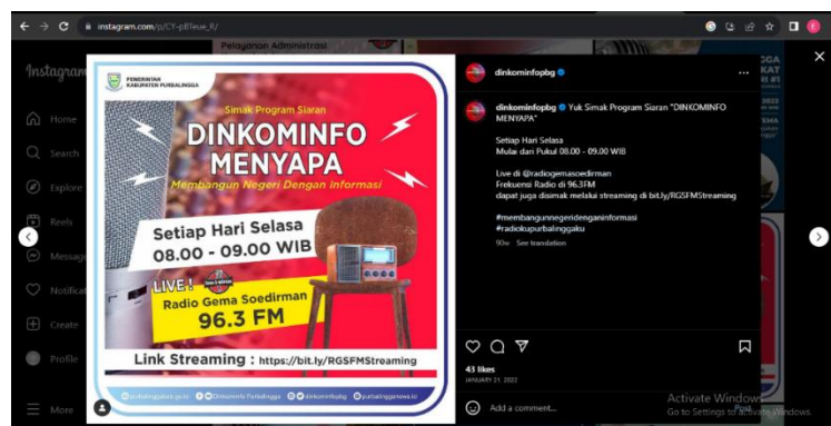
Fig. 6. Screenshot of the upload from the Instagram account @dinkominfopbg which tags @radiogemasoedirman