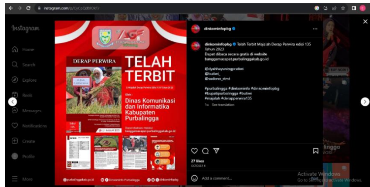
Fig. 3. Screenshot of promotional uploads for Derap Perwira magazine on the Instagram account @dinkominfopbg

"Before the full release, we released small parts in the form of flyers via social media Instagram, we only conveyed important information there. For each news flyer there are only two photos which are then given a caption, if you want to read more fully then use the magazine one. "You could say that Instagram is a promotion as well as a shorter form of information dissemination." (Sapto Suhardiyo, Chief Editor of Derap Perwira, 06/03/2023)