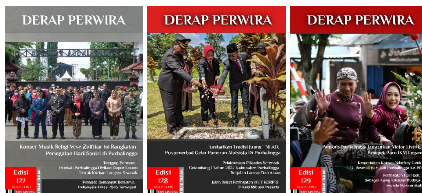
Fig. 2. Cover of digital magazine Derap Perwira editions 127, 128, and 129

It is recorded that starting July 2022, Derap Perwira has published a magazine in digital form which is consistently published once a month. e-Derap Perwira can be accessed via the portal www.banggamacapat.purbalinggakab.go.id ., as of this writing e-Derap Perwira has published its 135th edition.