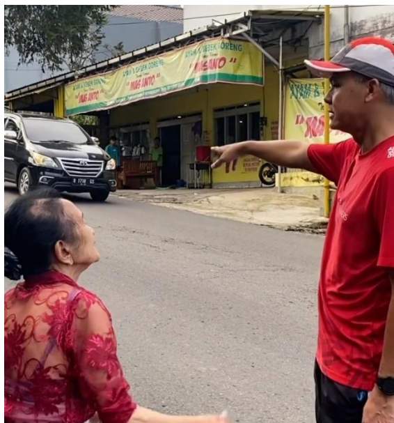
Fig 7. One of @ganjar_pranowo's Instagram posts four days after the declaration of presidential candidacy - April 25, 2023.

A post that also received a lot of public reaction was uploaded on the fourth day. The post used a video format containing Ganjar's activities while running but was interrupted by a grandmother who invited him to talk for a moment. The post managed to get the most comments totaling 4,255. In the video, the grandmother praises Ganjar several times and hopes he becomes the next President of Indonesia. Many agreed with the grandmother's words in the comment section, but not a few disagreed with them. Those who disagree consider the post a set-up to make Ganjar's image as a leader more visible. The visual of the fourth day's post can be seen in Figure 7.