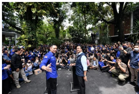
Fig 5. One of @aniesbaswedan's Instagram posts four days after the declaration of his presidential candidacy - October 7, 2022.

The post that also received many likes and comments was the fourth day's post with a difference of 147 comments from the fifth day's post. The fourth day's post featured 10 photos containing a meeting between Anies Baswedan and Agus Harimurti Yudhoyono along with the DPP of the Democratic Party. One of the visuals of the fourth day's post can be seen in Figure 5, complete with a long text explaining the photo in question.