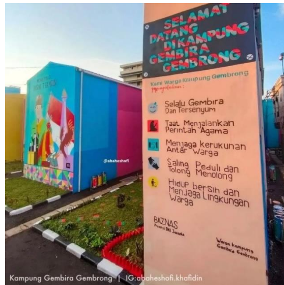
Fig 4. One of @aniesbaswedan's Instagram posts five days after the declaration of his presidential candidacy - October 8, 2022.