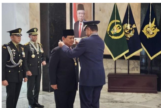
Fig 3. One of @prabowo's instagram posts three days after the declaration of presidential candidacy - August 15, 2022.

From the content aspect, Prabowo's third day post is a form of public appreciation for Prabowo as a former military man. From the content analysis of the comments on this post, many people gave appreciation and congratulations on the awarding of 4 honors to Prabowo. The number of congratulations to Prabowo strengthens his branding as a retired soldier. One of the visual uploads related to the awarding is presented in figure 3.