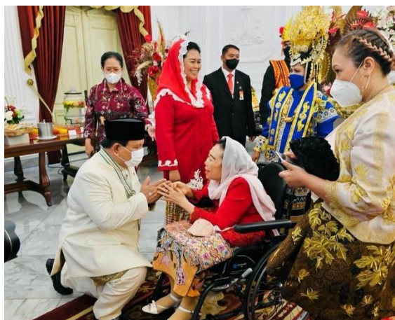
Fig 2. One of @prabowo's instagram posts five days after the declaration of presidential candidacy - August 17, 2022 (source: instagram.com/prabowo ).

On the fifth day of posting, Prabowo uploaded photos of himself with several popular political figures, namely with President Jokowi, Golkar Party Chairman Airlangga Hartarto, Coordinating Minister for Maritime Affairs and Investment Luhut Binsar Pandjaitan, and with Sinta Nuriah Wahid and Gus Dur's daughter (figure 2).